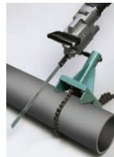
Model 5 1202 9960 Pipe Clamp for 4" to 12 3 / 4 " dia.*