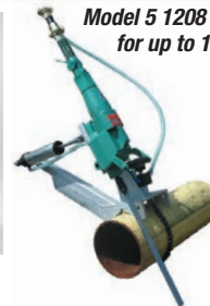
Model 5 1208 9980 Self-feeding Pipe Clamp for up to 12 3 / 4 " dia. pneumatic saws*