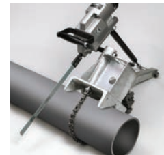
Model 5 1208 9990 Self-feeding Pipe Clamp for up to 12 3 / 4 " dia. electric and hydraulic saws*